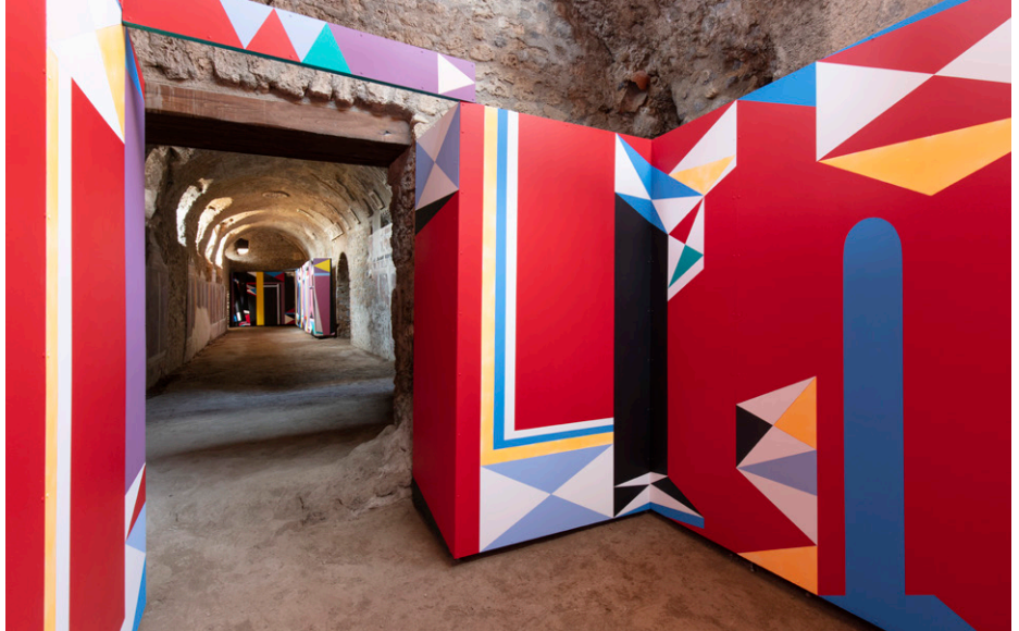
From top: Catrin Huber’s installation in Pompeii; Carcassonne’s concentric circles